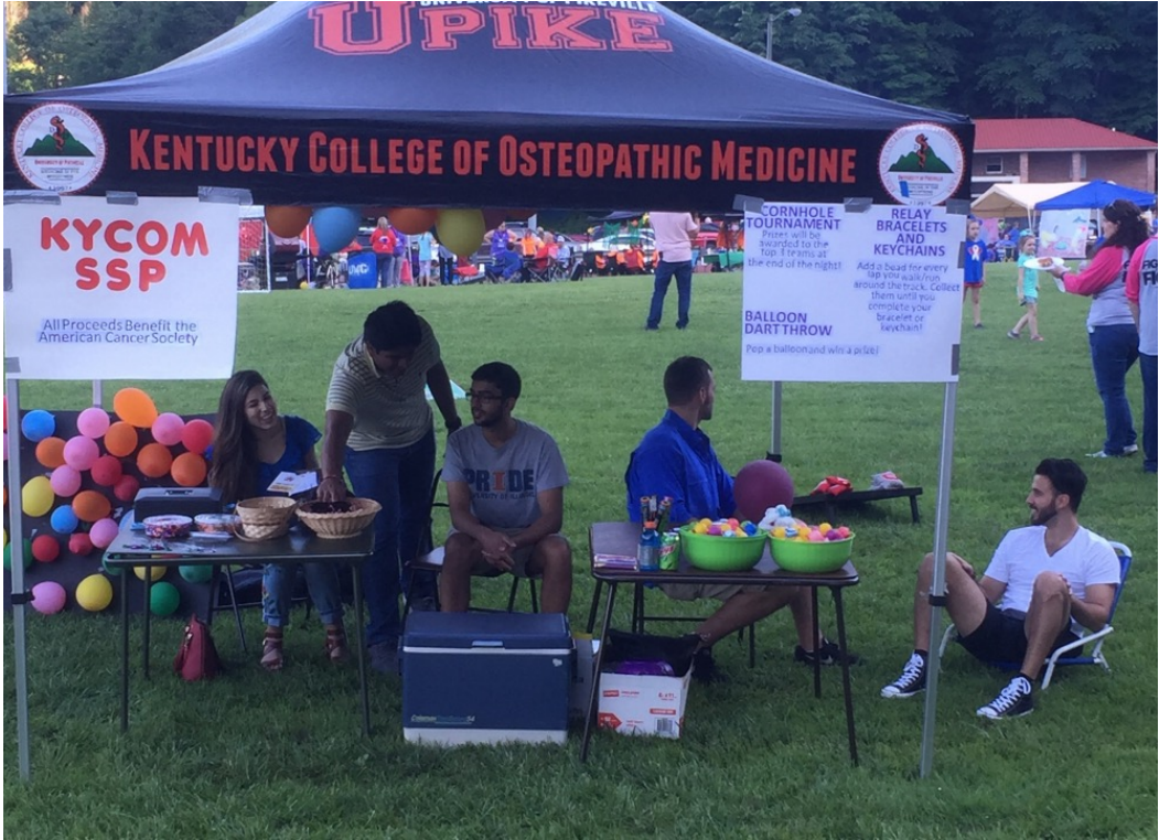
Relay for Life 2017