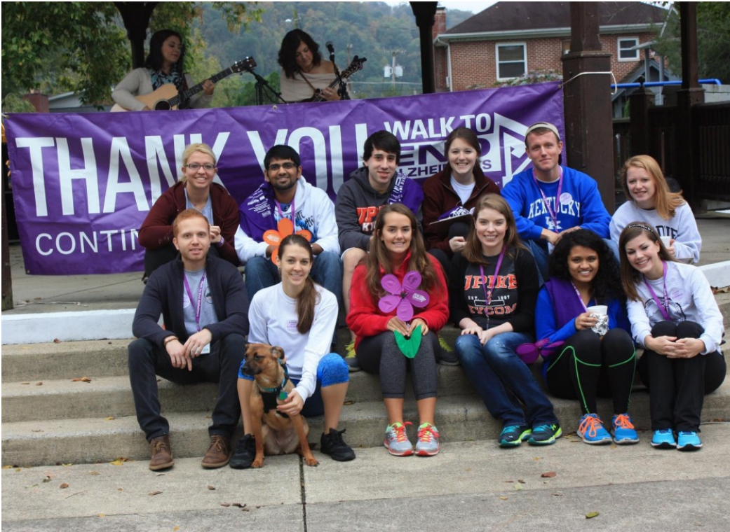
Walk to End Alzheimer's 2016