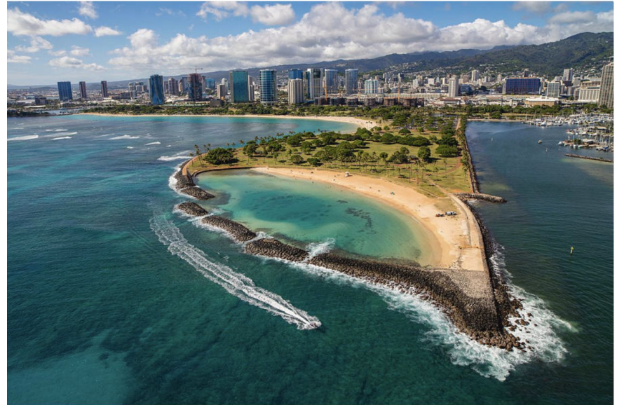
Ala Moana Beach Park and Magic Island

Members from the Hawaii CHC have organized a beach clean-up at Ala Moana Beach Park for March 27th. This location is a popular urban beach for locals and tourists alike. Given its high traffic, the park and beach can become littered with waste. With our event, we hope to help this landmark keep its natural beauty and improve the home range of local wildlife impacted by human activity.